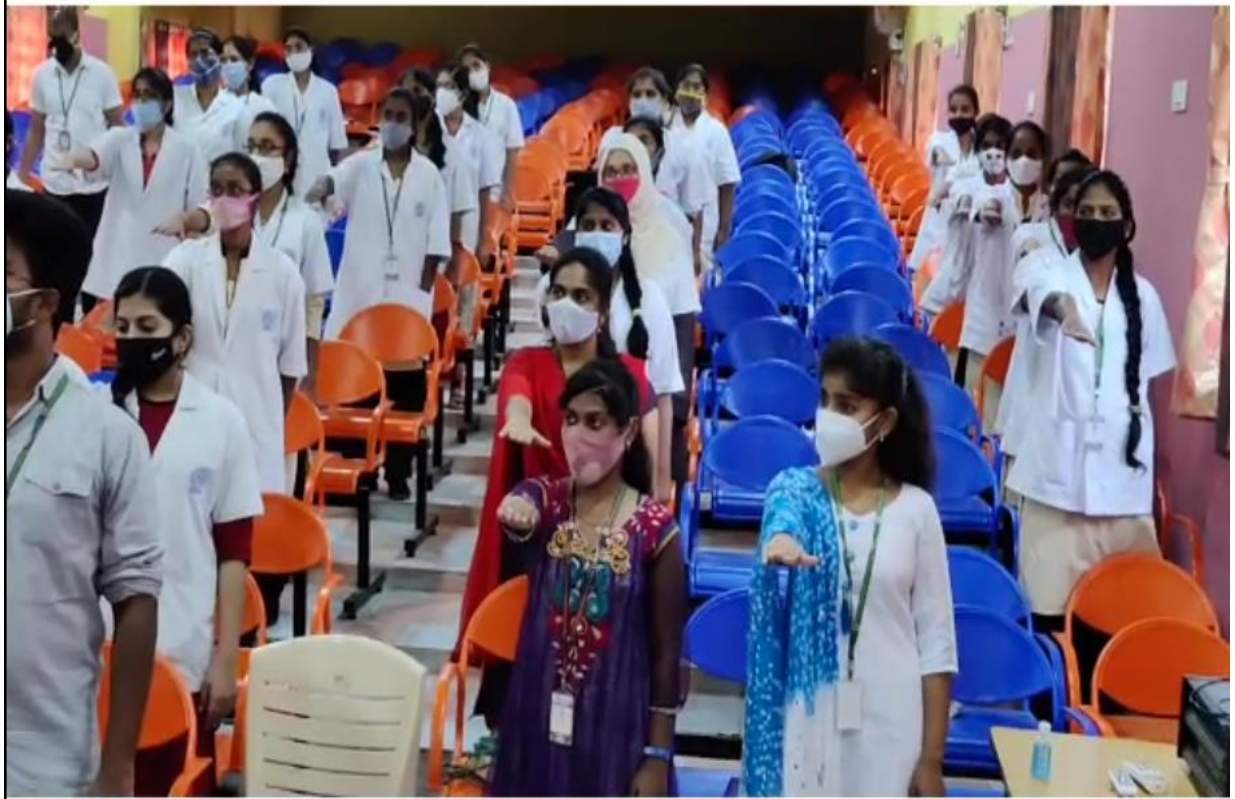
EBSB Club members - RIPER: