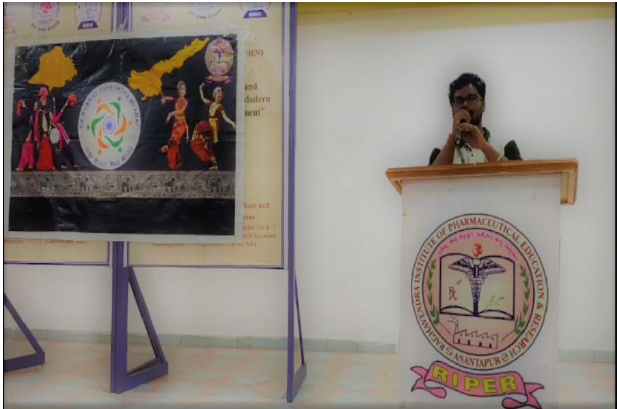
Pledge by Students and Faculty of RIPER: